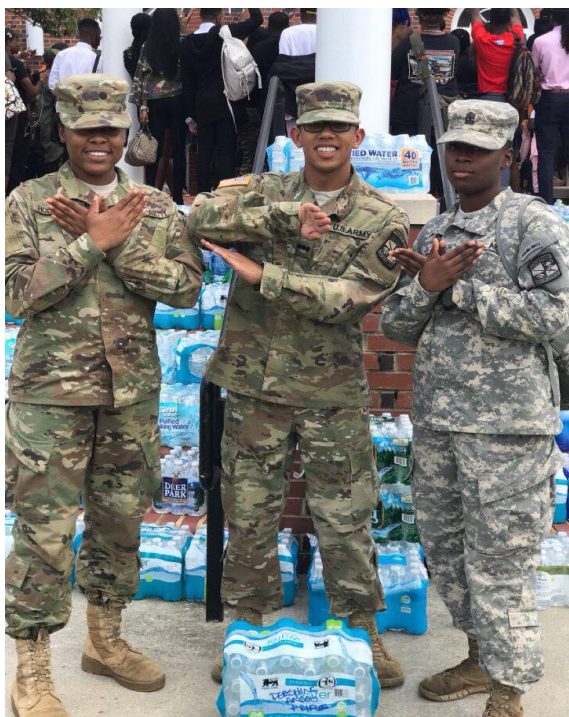
(Above): Giving back to those affected by Hurricane Harvey, O-4 joins forces with their fellow Pershing Angels at their college's water drive.