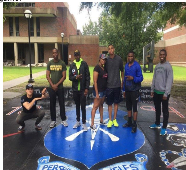
(Above): As the new academic year approached, Company R-4, Norfolk State University, helped with the university's move-in day.