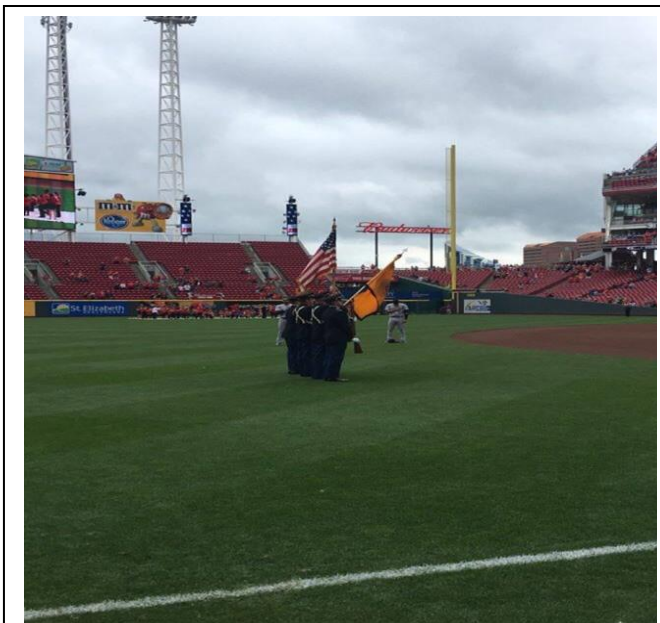
(Above): Company B-1, University of Dayton, presents the colors at a Cincinnati Reds' baseball game.